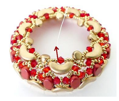
21) Here is the result ☺ Exit through the B3