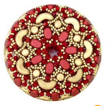
34) Here is the result Make a second identical element