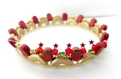
8) Return your work. Insert 1 B3 between the Lipsi and the central SB11 throughout the row 😊