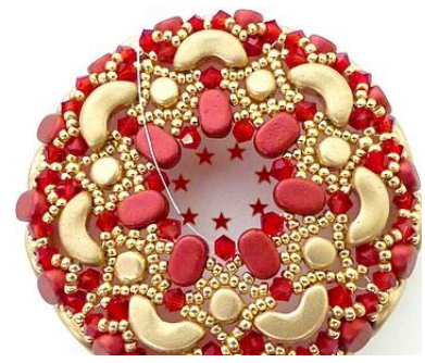
30) Insert 1 B3 between each Lipsi