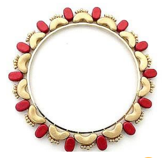
6) Here is the result 😂