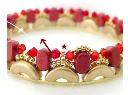
11) Insert 1 SB15 through the B3. Alternate steps 10 and 11 for the whole row