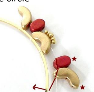
5) Ascend to the Arcos. Insert 1 Lipsi and 1 Arcos. Pass under the circle. Repeat steps 3 to 5 all the way around