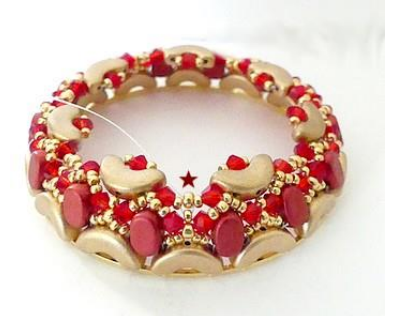
16) Insert 1 SB11between SB15.All the way around ☺