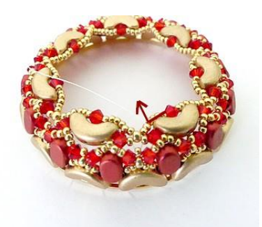
19) Here is the result Exit through the third SB15 after the B3