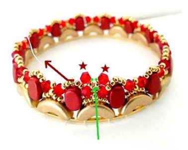
13) Insert 1 B3 and 1SB15 through the SB15then insert 1 SB15 and 1B3 through the centralSB15