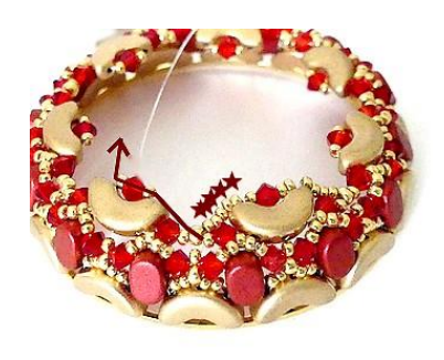
18) Insert 5 SB15 through the SB11. Repeat steps 17 and 18 throughout the row