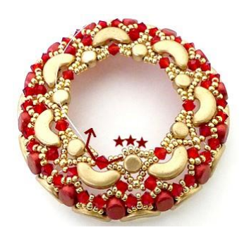
24) Insert 3 SB15 under the Kalos throughout the row