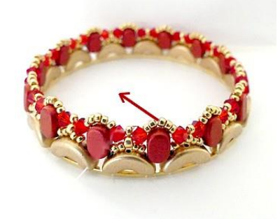
12) Here is the result Exit through the central SB15