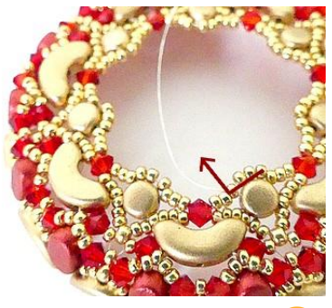
25) Here is the result <sup>☺</sup> Exit through the fourth SB15