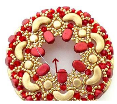
29) Here is the result 😌 Exit through the Lipsi HERE