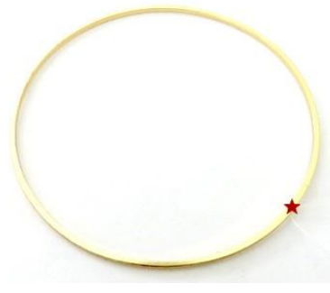
1) Make a knot on the circle