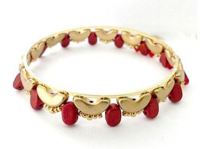
7) Place the work like this