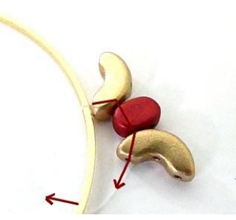
2) Insert 1 Arcos, 1 Lipsi, 1 Arcos and go out under the circle