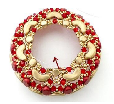
23) Here is the result Exit through the 3 SB15 HERE