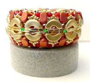
35) Place the elements on top of each other and assemble them with your thread.