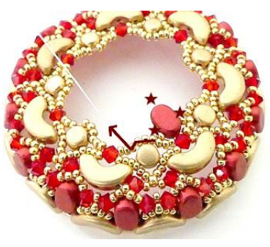
26) Insert 1 SB15, 1 Lipsi and 1 SB15 through the next 4 SB15.