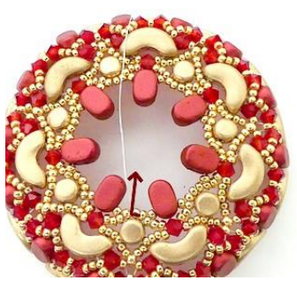
27) Here is the result Exit through the central SB15 under the Kalos