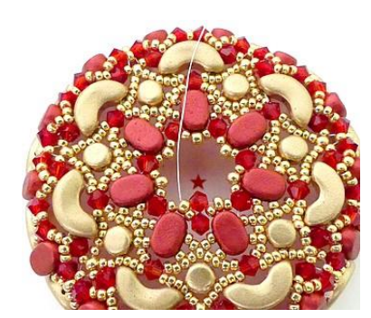
33) Insert 1 B3 betweenSB11. Tighten well andend your thread