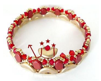
14) Insert 1 Arcos, 1 SB15, 1 B3 and 1 SB15 through the central SB15. Continue alternating steps 13 and 14 throughout the row