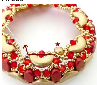
20) Insert 1 Kalos through the next 4 SB15, then the B3 and the 4 SB15. All the way around 😂