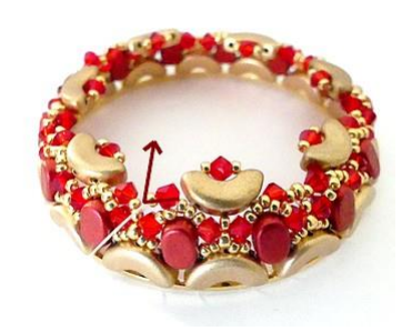
15) Here is the result 😊 Exit through the B3 and the SB15 HERE