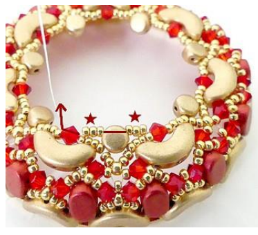
22) Insert 3 SB15 on each side of the Kalos.All the way around ☺