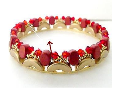
9) Here is the result 😊 Exit through the B3 HERE