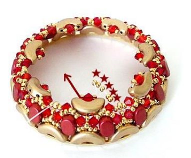
17) Exit through the SB11 of step 16 (red star). Insert 5 SB15 through the SB15, B3 and SB15 of the Arcos