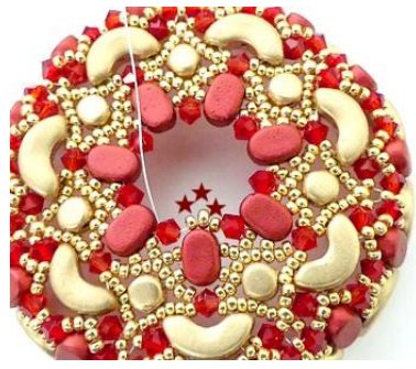
31) Insert 1 SB15, 1 SB11 and 1 SB15 through the B3