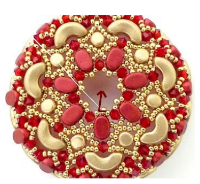
32) Here is the result 😊 Exit through the SB11 HERE