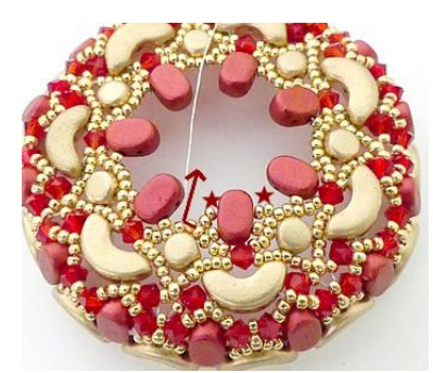
28) Insert 2 SB15 on each side of the Lipsi through the central SB15 All the way around 😊