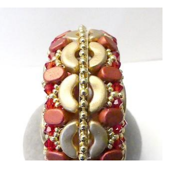
36) Glue a chain of your choice